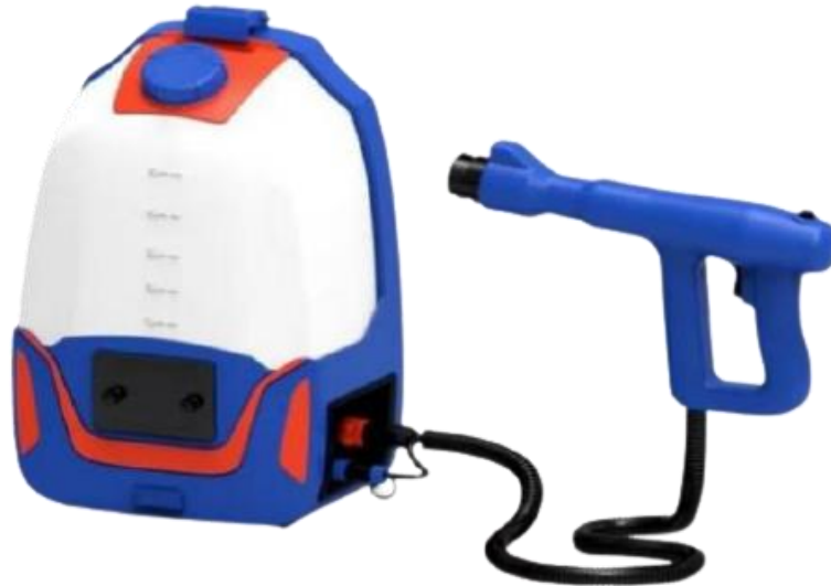
GERMCLEAN™ MODEL ESP-3014 BACKPACK ELECTROSTATIC SPRAYER